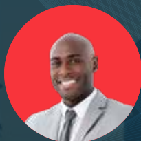
Head of Operations

Oversees company strategy, operations, and business growth.